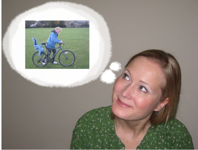
Fig. B1. Example target sentence elicitation picture.