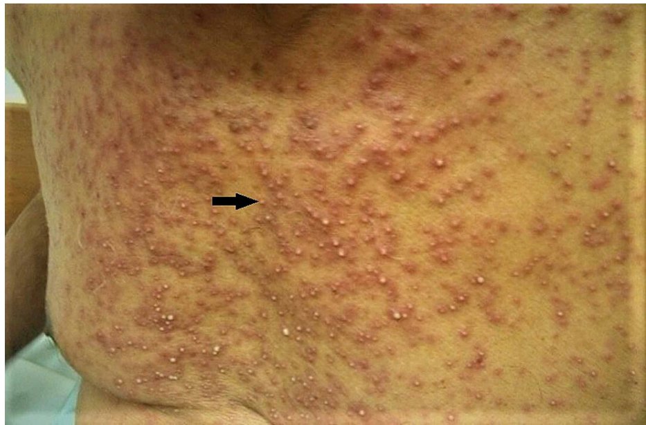
FIGURE 1: Multiple pinpoint pustules appeared on diffuse edematous and erythematous plaques and patches on trunk