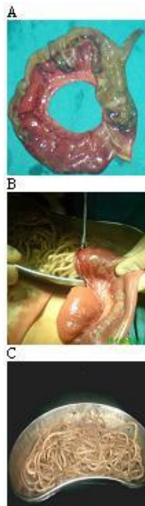
Figure 1 Demonstration of ileum with its located Meckel's diverticulum, both had gangrene. Ileum had twist which lead to gangrene of ileum, together with its located Meckel's diverticulum with worms seen inside. There was proximal and distal bolus of worms at point of twist around which ileum had volvulus. B. Demonstration of resected ends of ileum which had gangrene. Both resected ends were used as enterotomy sites for removal of worms. C. Demonstration of worms removed via enterotomy wound.

Meckel's diverticulum is the most common congenital anomaly of the gastrointestinal tract [3]. The occurrence of symptomatic Meckel's diverticulum in male and female has ratio of 3:1, with complications being more frequently encountered in males [4]. Reports from autopsy and retrospective studies show incidence ranges from 0.14 to