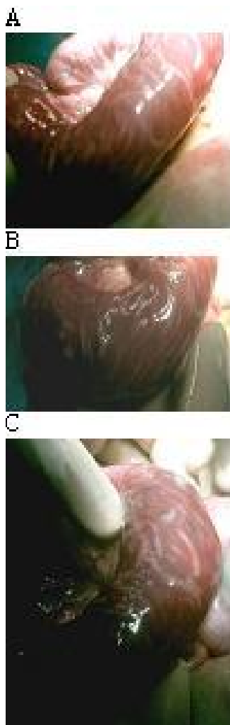
Figure 4 A & B Showing of impacted long worm bolus with trans-serosal visibility. C. Showing of impacted worm bolus with gangrene of distal small gut due to mechanical obstruction.

done when multiple impacted worm boluses widely apart in small gut are present.