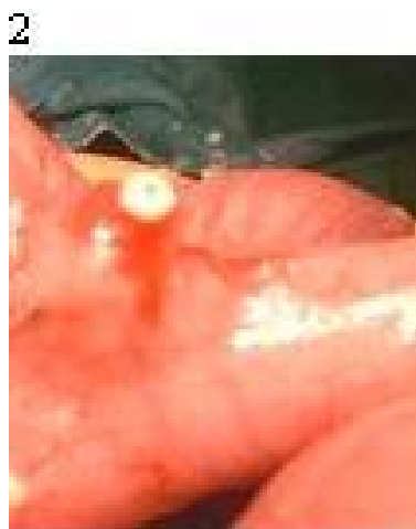
Figure 2 Perforation at tip of Meckel's diverticulum through which worms escape into peritoneal cavity.

most common complication seen in the children [6]. Mode of intestinal obstruction involves mechanical obstruction, intussusception or volvulus of small gut. Mechanical obstruction is the most frequent mode of small gut obstruction and is due to bolus of worms (Fig 3A, B & Fig 4A, B, C). Ascariid intestinal obstruction can be manifested as partial or the complete type of small gut obstruction. In children, abdominal pain, vomiting and abdominal distension are usually present. There can be diarrhea, constipation, passage of worms with stools as well as with vomitus.