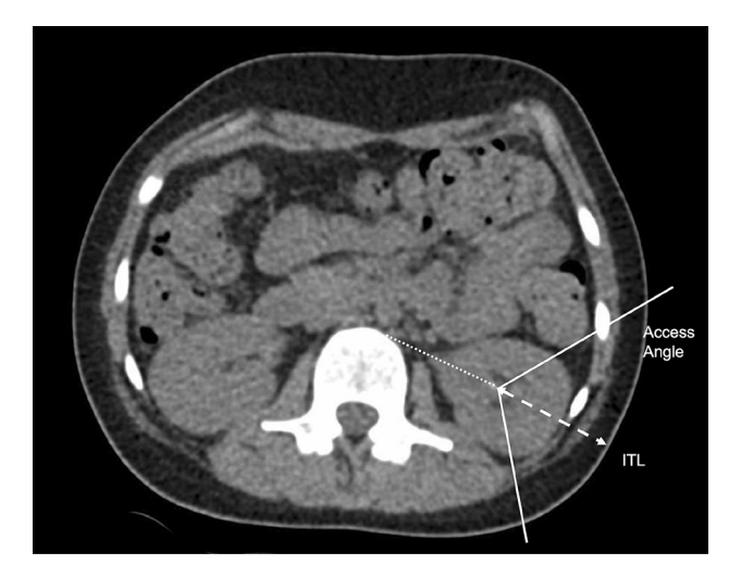
Fig. 1 Ideal tract length (ITL) with the presence of ribs in the access angle measured on axial CT images

Uni- and multi-variate statistical analyses were performed in RStudio (version 1.0.136). Mean values with standard deviation (SD) for normally distributed variables, median values with minimum and maximum values for variables without normal distribution and percent values for categorical variables were used for descriptive statistics. The Chisquare test was applied for qualitative data whenever applicable. Normal distribution of quantitative data was proven with the Shapiro–Wilk test. The Mann–Whitney U (MWU)