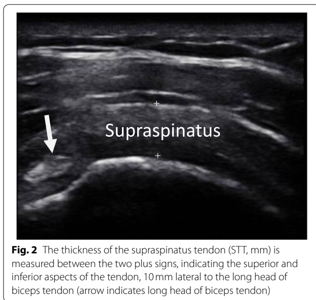
Fig. 2 The thickness of the supraspinatus tendon (STT, mm) is measured between the two plus signs, indicating the superior and inferior aspects of the tendon, 10 mm lateral to the long head of biceps tendon (arrow indicates long head of biceps tendon)

image the sonographer identified the transverse section of the supraspinatus tendon 10 mm lateral to the edge of the long head of biceps tendon. At this section of the supraspinatus tendon, the STT was calculated using the US machine's measurement tool. The sonographer visually identified and marked (using plus signs) the superior and inferior aspects of the supraspinatus tendon, as shown in Fig. 2. The US machine automatically calculated the distance between these two points in millimetres (mm). Both SIS and asymptomatic participants had their STT recorded.