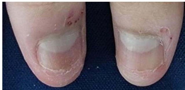
Figure 4 After undergoing three PDL treatments, the previously dystrophic thumbnails have tremendously improved. However, signs of onychotillomania were noticed, including small erosions with bloody crusts on the proximal nail folds.