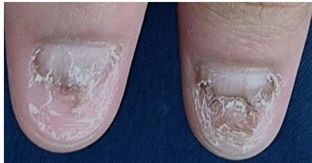
Figure 2 After receiving one PDL treatment, remarkable improvements in the appearance of the nail plate, nail bed, and surrounding skin can be noticed.

After undergoing three PDL treatments, the previously dystrophic thumbnails showed significant improvement. However, it has been noticed that there are some signs of onychotillomania, which include the presence of tiny erosions and bloody crusts on the proximal nail folds. This could suggest that the patient still occasionally pulls at her nails (Figure 4). In order to prevent further damage, the patient was advised to temporarily apply bandages to her thumbnails and keep her nails short.