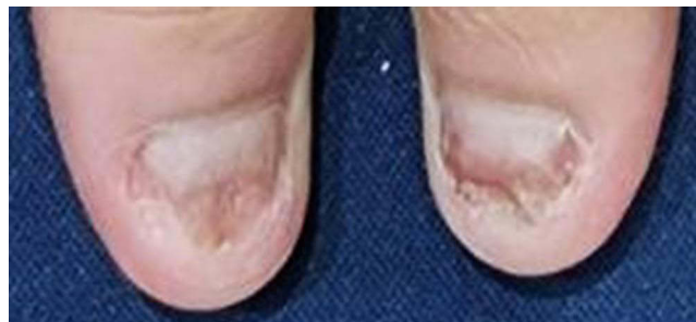
Figure 3 Following two PDL treatments, a significant and sustained improvement has been observed in both thumbnails and periungual skin.