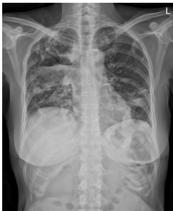
Figure 4 Chest radiography showed large cavitary consolidation with internal air-fluid level in right upper and middle lobes.

Sepsis with at least one bacteria identified on a blood culture; (3) Clinical or imaging findings of IJV thrombosis; and (4) At least one metastasis.