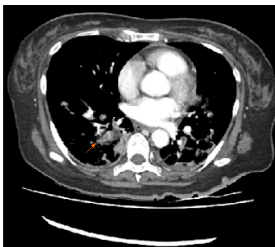
Figure 2 Computed tomography scan of the chest showed suspicious pulmonary thromembolism in segmental and subsegmental pulmonary arteries of right lower lobe (orange arrow).