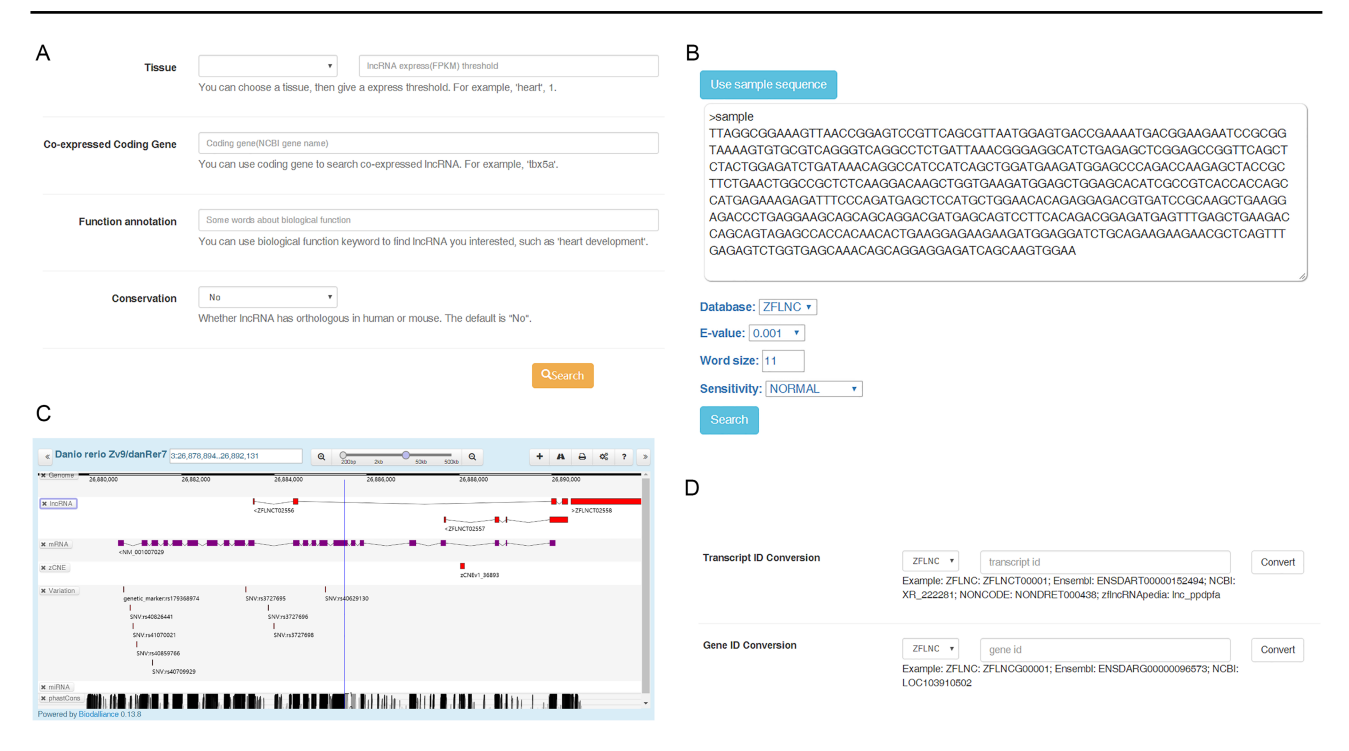
Figure 2. Usage of the database. (A) Filtering conserved functional IncRNA candidate through 'Advanced functional IncRNA filtering' function. (B) Finding zebrafish IncRNA through BLAST sequence similarity search. (C) Finding zebrafish IncRNA through sequence positions in GBrowser. (D) Converting IDs among diverse databases by using 'ID Conversion'.

zflncRNApedia, the 'ID Conversion' module can assist in the ID switch into 'ENSDART00000152494' in Ensembl or 'ZFLNCT00001' in ZFLNC. Another scenario is that you only know the sequence of one lncRNA, but now, you can use 'BLAST' module to find this lncRNA in ZFLNC through sequence similarity (Figure 2B). For example, using 'BLAST' module, you can find human MALAT1 homolog in zebrafish, ZFLNCT12716. At last, if you only know the genomic location of one lncRNA, you can use 'Gbrowser' module to search the lncRNA in ZFLNC (Figure 2C). For example, you can find lncRNA ZFLNCT15181, which is a highly conserved lncRNA (PhastCons: 0.94), through the genomic location danRer7 chr18: 265 594–269 844.