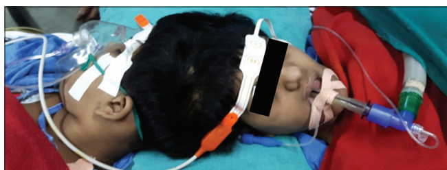
Figure 1: Craniopagus twins

Twins were placed in supine position with legs facing in the opposite direction [Figure 1]. Separate intravenous (IV) access secured for both with 20-gauge IV cannula and monitoring included heart rate, ECG, noninvasive blood