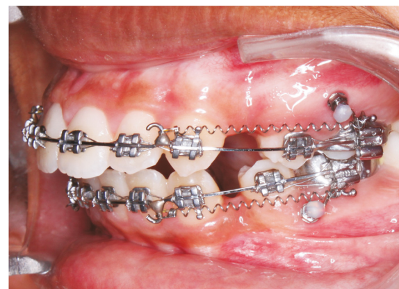
Figure 1 Assembly showing retraction mechanics using miniscrew as anchorage.

Each sample of PMCF was collected by a 1 to 5- \mu l calibrated volumetric micro-capillary pipette (Sigma Aldrich Chemicals Company Limited, Bangalore, India) placed at the crevice, according to the method described by Griffiths [12]. The samples were collected at the following time observations: T1 (4 h after miniscrew placement), T2 (baseline, 3 weeks just prior to loading) and on loading T3 (0 day), T4 (1 day), T5 (21 days), T6 (72 days), T7 (120 days), T8 (180 days) and T9 (300 days) (Table 1). Although PMCF sample T1 was taken 4 h after miniscrew placement to allow cessation of bleeding, PMCF samples