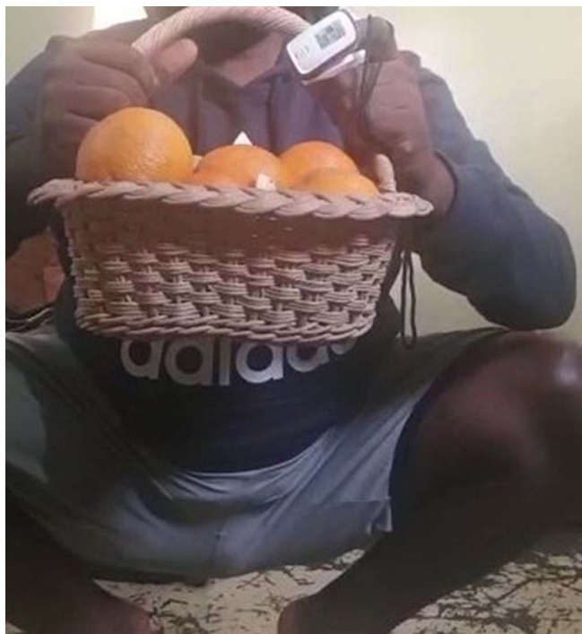
FIGURE 1. Patient performing a goblet squat with weighted overhead reach, improvised with a basket filled with objects including fruits.

Pulmonary Disease Assessment Test [CAT] 12 ), and subjective experience of fatigue (using the Checklist Individual Strength fatigue subscale [CIS-Fatigue] 13 ). At baseline, the patient scored 3 on the mMRC dyspnea scale and 8 on CAT. According to the Global Initiative for Chronic Obstructive Lung Disease guidelines, 14 an mMRC score of 2 or higher or a CAT score of 10 or higher is indicative that dyspnea was a significant symptom, with a remarkable impact on health status. His CIS-Fatigue score of 43 exceeded the threshold for “severe fatigue” (>35). 15