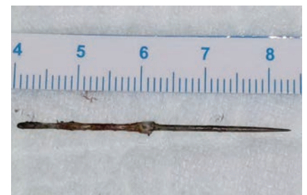
Figure 3. The tapestry needle, which was successfully removed from urethra.