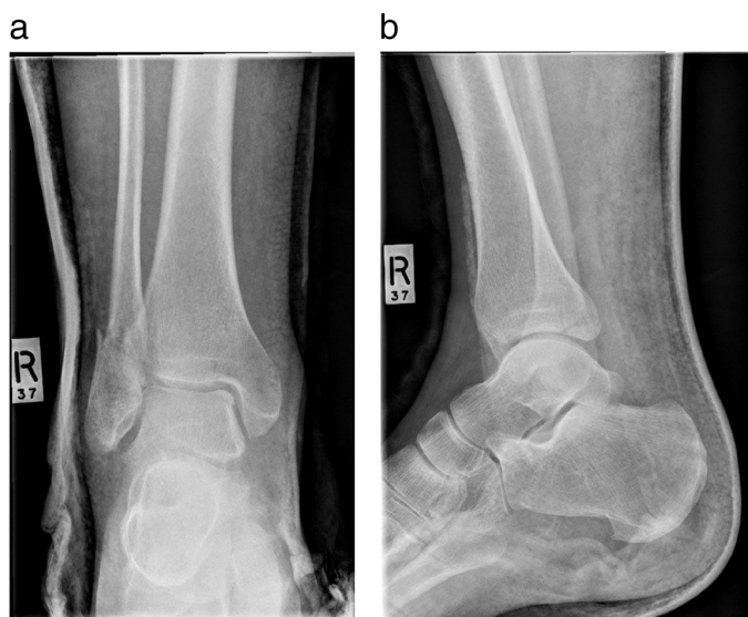
Fig. 1. a: Anteroposterior radiograph of the right ankle dated 5 August 2006 showing a trimalleolar fracture. b: Lateral radiograph of the right ankle dated 5 August 2006 showing a trimalleolar fracture.

Ankle injuries involving a fracture of the medial malleolus and associated rupture of the Achilles tendon have been described [1–7].