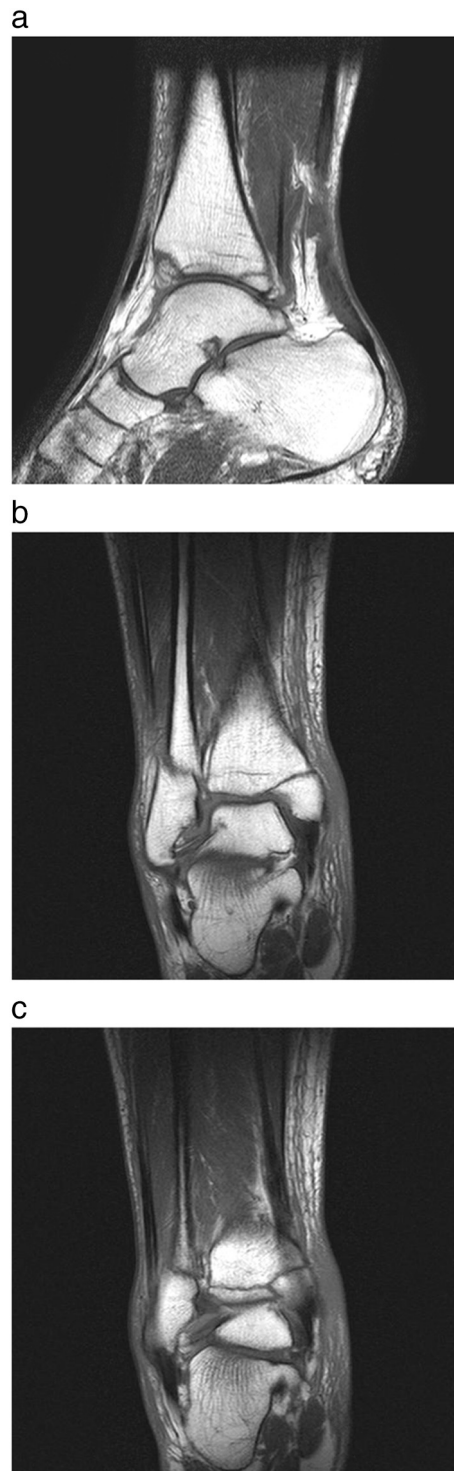
Fig. 2. a: MRI scan of right ankle dated 9 August 2006, showing fractures of the medial and posterior malleoli and rupture of the Achilles tendon. T1WTSE, TE 20/TR 500.

b: MRI scan of right ankle dated 9 August 2006, showing fractures of the medial, lateral and posterior malleoli. T1WTSE, TE 20/TR 500.