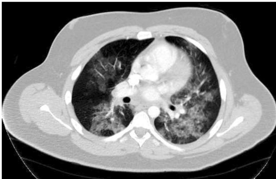
Fig. 2 Axial CT Chest Scan with IV contrast: Diffuse bilateral ground-glass opacities throughout both lungs, demonstrating predominantly a perihilar distribution, with areas of mild bronchial wall thickening. Several mildly prominent hilar lymph nodes, the largest measuring 1.2 cm in the short axis on the right

Vitals on presentation as follows: temperature was 99 °F; BP was 135/91 mmHg; HR of 120 BPM; RR of 20 BRPM; SpO 2 88% on ambient room air. Laboratory findings were notable for leukocytosis with a white blood cell count (WBC) of 16,500 cells per microliter, with