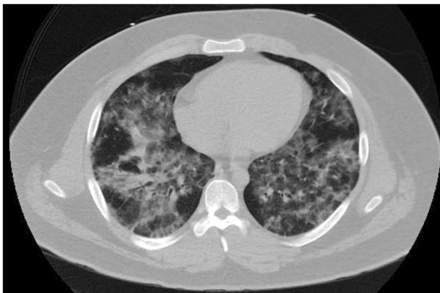
Fig. 3 Axial CT Chest without IV Contrast: Diffuse interlobular septal thickening and ground-glass opacities involving the bilateral lung fields

One thousand eighty cases of vaping induced pneumonitis have been reported to the CDC as of October 1st, 2019. These cases come from 48 different state health departments and 1 U.S. territory. All patients had a history of e-cigarette use. The course of the disease process typically begins with pulmonary symptoms of nonproductive cough, pleuritic chest pain, and/or shortness of breath lasting over several days to weeks before the patient is hospitalized. All patients described in these reports had abnormal imaging that included infiltrates on chest radiograph and ground-glass opacities on chest CT scan. Gastrointestinal findings include nausea, vomiting, abdominal pain, and diarrhea have also been seen in these patients. Many patients, due to the nonspecific symptoms, received an initial diagnosis of infection and were treated with empiric antibiotics, which did not lead to improvement. One of the most severe symptoms that led to hospitalization was hypoxemia, which in some cases progressed to acute or subacute respiratory failure [2]. Patients in these cases needed multiple supplemental therapies, including supportive oxygen, endotracheal