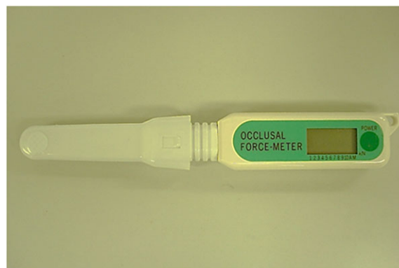
FIGURE 2 Occlusal Force-meter GM10 (Nagano Keiki Co. Ltd., Tokyo, Japan)

Bite force was measured unilaterally on both sides in the first molar region using a portable occlusal force gauge (Occlusal Force-meter GM10, Nagano Keiki Co. Ltd., Tokyo, Japan; Figure 2). The subjects were seated with the Frankfort plane nearly parallel to the floor and instructed to bite on the biting element as hard as possible for 3 s. The force gauge displayed the highest recorded value. Bite force was measured alternately twice on each side with 30-s interval after each