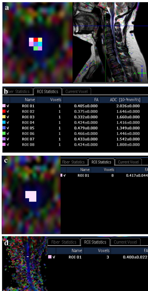
Figure 2. Three different fractional anisotropy (FA) measurement methods at the C2/C3 level applied in diffusion tensor images of a 53-year-old woman. (a) The mean region-of-interest (ROI) method using each voxel inside the spinal cord on the axial image, guided by a sagittal T 2 -weighted turbo spin-echo (TSE) image. A total of eight voxels were placed on the spinal cord. (b) The calculated average FA values for all voxels inside the spinal cord from the mean ROI method range from 0.332 to 0.479. These FA values were averaged per cord level across all subjects. In this patient, the mean FA value is 0.417. Additional apparent diffusion coefficient (ADC) values for each voxel were also automatically calculated. (c) The manual ROI method, using a freehand technique, which represents approximately one voxel. The calculated FA value is 0.417. (d) The sagittal ROI method, using a freehand technique, which represents approximately one voxel. The calculated FA value is 0.400.