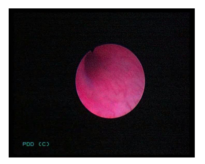
Figure 3 PDD showing a single area of CIS.

However, these high sensitivities were all reported for bladder tissue, and a thorough search of previous reports failed to identify any studies reporting the use of PDD in the UUT, other than two case series of four patients each [4,14], one of which [4] was our initial experience. In this audit, although there was no statistically significant difference between WLU and PDD, PDD detected more lesions and tumours. WLU missed all the CIS and dysplastic lesions, but these were detected with PDD (Figs. 3 and 4). The FP result with WLU was a scar tissue, which was not fluorescent under PDD. While PDD did