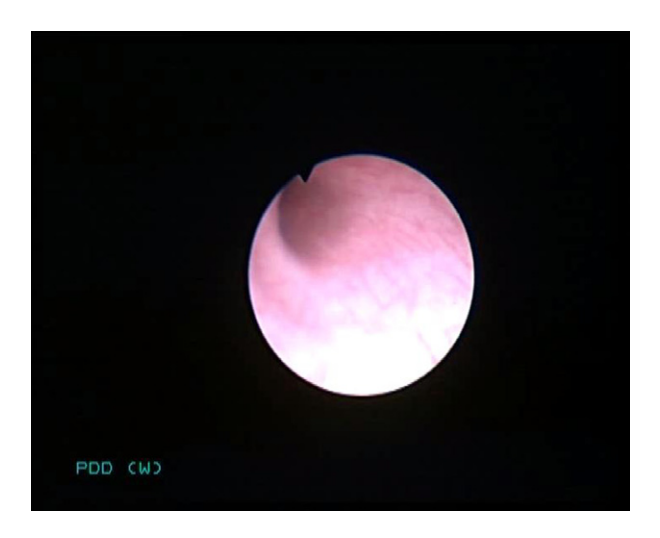
Figure 4 WLU of the same area as in Fig. 3, showing no obvious lesion.

not detect a G3pTa lesion, WLU detected this, but we are unable to explain why there was no fluorescence.