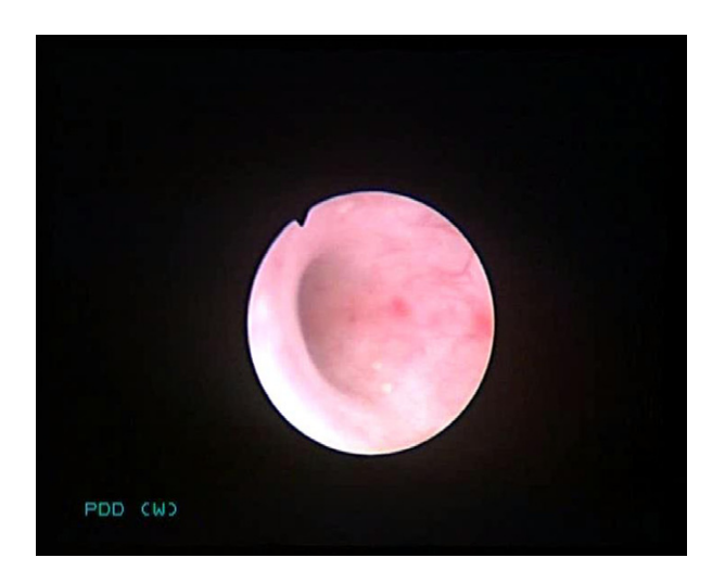
Figure 2 WLU of the same area as in Fig. 1, showing two lesions.

WLC found that PDD is more effective than WLC for detecting malignant bladder lesions and CIS, in addition to having a more complete resection during TURBT [7]. Furthermore, two of these randomised controlled trials found that PDD-TURBT increases the recurrence-free survival of patients with non-muscle-invasive cancers [7].