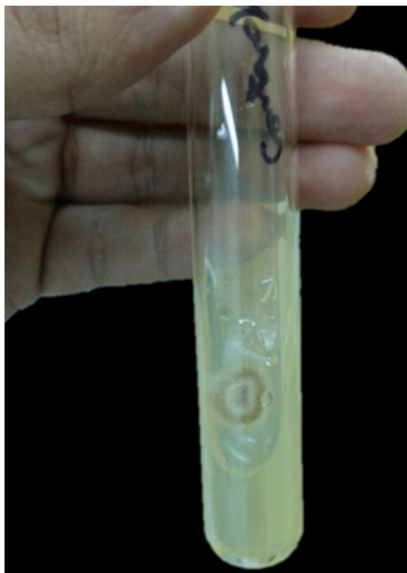
Figure 2 Culture in Sabouraud agar medium.

patient reported that she had undergone RYGB surgery two years before justified by obesity.