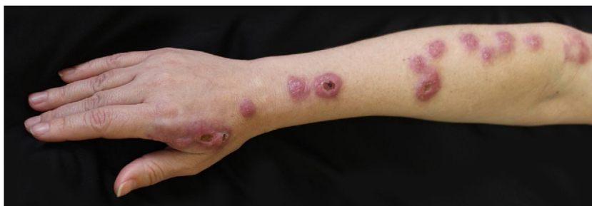
Figure 1 Clinical picture prior to treatment with terbinafine. Nodules approximately 2 cm in diameter, discretely erythematous that followed the lymphatic drainage pathway of the right upper limb. In some lesions there was formation of central ulcers.