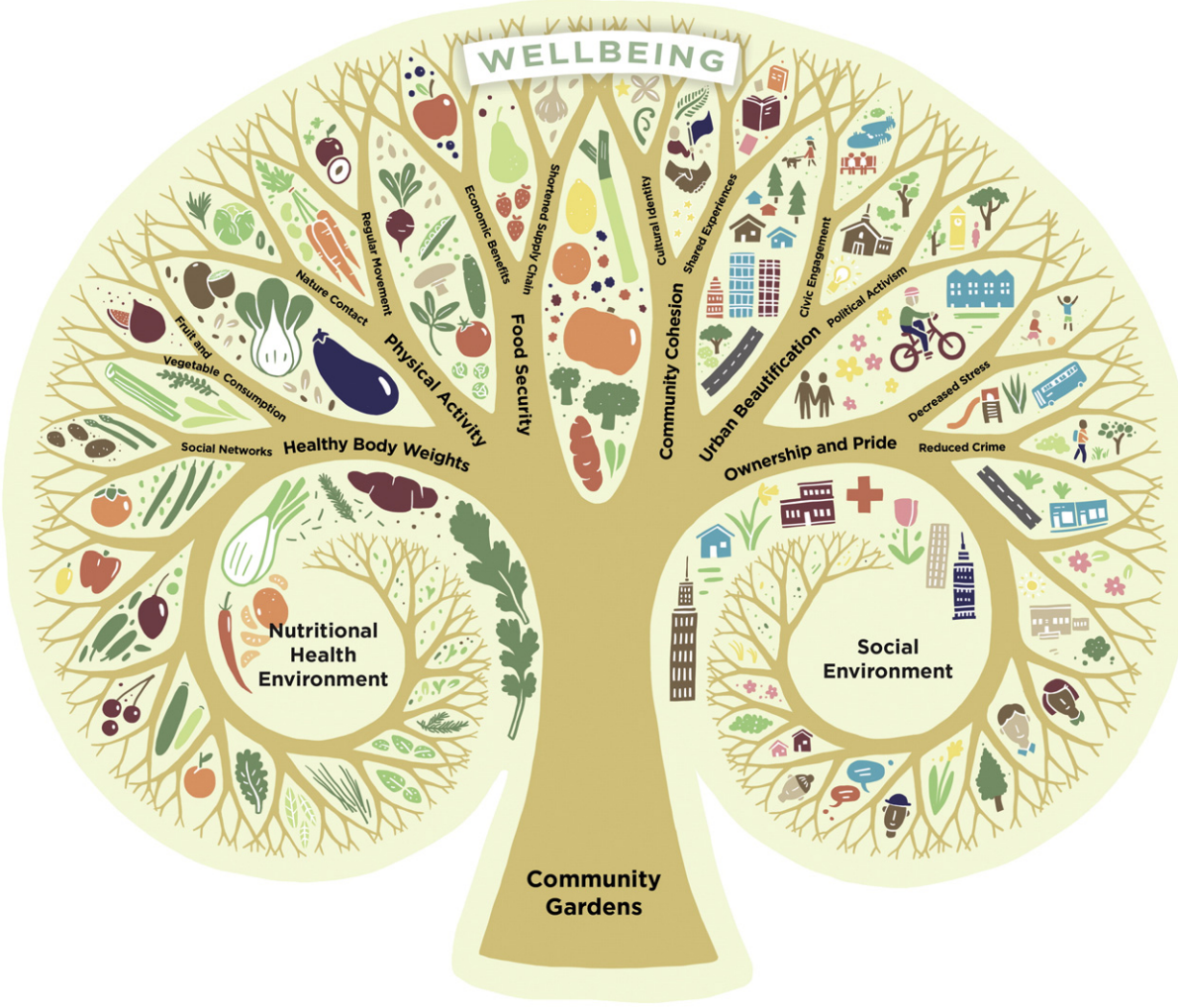
This work is licensed under the Creative Commons Attribution-NonCommercial-ShareAlike 4.0 International License To view a copy of this license, visit http://creativecommons.org/licenses/by-nc-sa/4.0/.