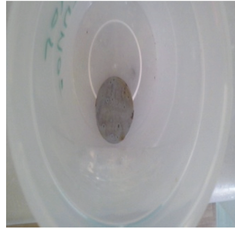
FIGURE 2: Withdrawn specimen. Note the significant corrosion of its surface.

Our case describes the presence of multiple acute gastric mucosal erosion found during endoscopy in an 18-month-old male patient, 4 hours after CR2025 3 V button battery