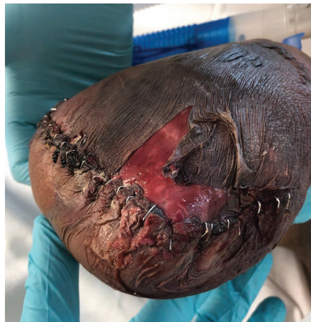
Fig. 1. Anterior skin flap necrosis developed 2 weeks after transhumeral amputation.

Surgeons may consider early hematologic consultation, a practice that has demonstrated improved outcomes in other patients at a high risk of perioperative thrombosis. 5