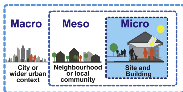
Fig. 1. Nursing home design and the macro, meso, and micro spatial scales.

Mapping local resources and creating service and care pathways among acute care, long-term care, health services, and the local community are critical to the implementation of integrated care for older persons. 29 This integration is vital during certain emergency situations, first for evacuating residents of nursing homes to hospitals if required, and second for bringing emergency and medical aid to residents where evacuation is not safe or appropriate. 22