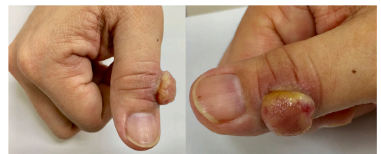
Figure 1 Pyogenic granuloma: macroscopic findings. A pedunculated tumour of approximately 20 mm was seen on the right thumb DIP joint. DIP, distal interphalangeal joint.

For immunostaining, heat-induced antigen retrieval was performed by incubating sections with 10 mM Tris base containing 1 mM ethylenediaminetetraacetic acid (pH 9.0). To detect VEGFR2, a section was incubated with an anti-VEGFR2 rabbit monoclonal antibody (clone 55B11; Cell Signaling Technology, Danvers, Massachusetts, USA), followed by incubation with an anti-rabbit peroxidase polymer (Nichirei Bioscience, Tokyo, Japan). The reaction products were developed with a diaminobenzidine solution (Dako, Glostrup, Denmark). Thymidine kinase-1 (TK1) and cluster of differentiation (CD31) double immunostaining were performed using an anti-TK1 mouse monoclonal antibody (clone F12; Bio-Rad, Hercules, California, USA) and anti-CD31 rabbit monoclonal antibody (clone EP3095; Abcam, Cambridge,