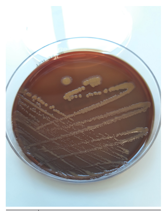
Figure 2 | Mycobacterium smegmatis in chocolate agar

Processing: The samples were cultivated in aerobic/anaerobic media (blood agar, chocolate agar, MacConkey, Brain Heart Infussion and Thioglycolate). After 6 days of incubation some colonies appeared with yellow-orange pigmentation in the blood agar and chocolate agar media (figure 2), with no growth in MacConkey which showed violet crystal.