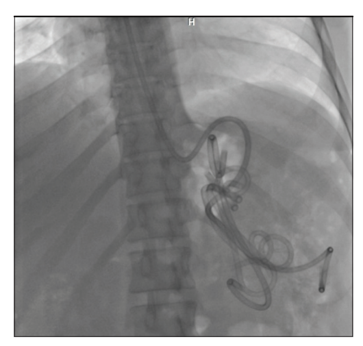
Figure 1 Endoscopic transmural drainage of walled-off necrosis with multiple plastic stents and nasocystic catheter