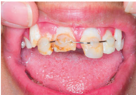
FIGURE 3: Splinting with a nonactive orthodontic wire and composite after surgical repositioning.

Case two presents the younger brother, aged six. He received a confirmed diagnosis of MSD in his first months of life. Additionally, he was also antenatally diagnosed with thoracic open myelomeningocele and hydrocephalus, which required immediate neurosurgical correction postnatally. He was born from normal vaginal delivery with bilateral talipes, which was treated conservatively.