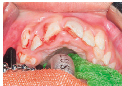
FIGURE 1: Initial presentation of dental trauma showing a 3 mm intrusion of the UR1 and a complicated mesial incisal fracture of the UL1.

Six months later, he presented to the dental department with trauma of the maxillary right and left central incisors (UR1 and UL1) (Figures 1 and 2). Extraorally, oedema and erythema of both lips were observed. Intraorally, a small laceration on the labial mucosa adjacent to the mandibular left lateral incisor (LL2) was evident. Dental injuries included a mesial incisal complicated fracture of the UL1 with grade 2 mobility and a 3 mm intrusion of the UR1. Maxillary occlusal radiography identified a potential tooth fragment in the upper lip. Challenging cooperation necessitated management under general anaesthesia. Stage one root canal