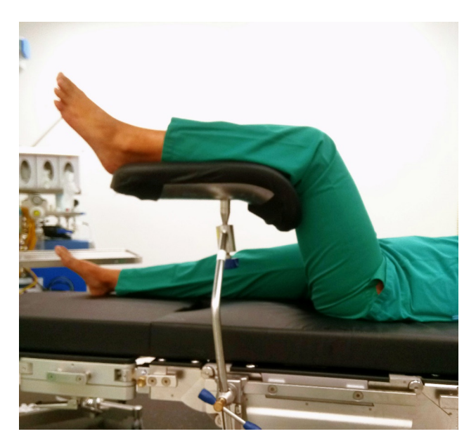
Figure 2 Göpel type support, example of which was used for our cases photography taken by the authors in the Operation room with authorization of the heads of department and the institution.

decreases the perfusion pressure as described by Meyer et al, who carried out dynamic pressure measurement of pressures in each compartment of the leg in healthy subjects when lying flat, compared to when positioned on a classical leg support.<sup>18</sup>