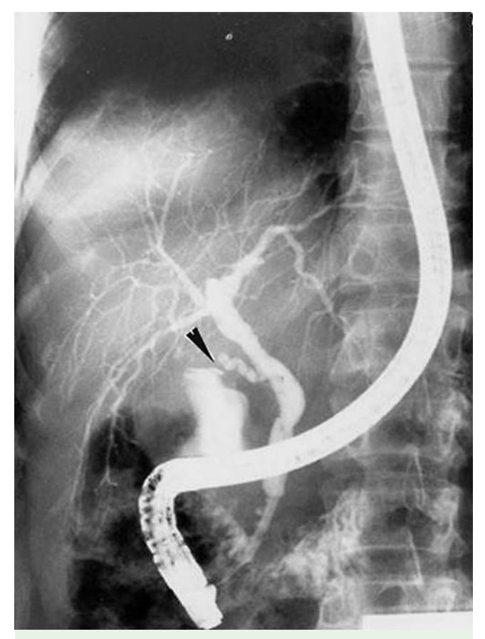
Fig.4 Endoscopic retrograde cholangiopancreatography showing cystic duct leak (arrowhead) (minor bile duct injury).

On initial endoscopy, 3 patients had missed stones. On follow-up, the patient who underwent endoscopic sphincterotomy and stone extraction had a persistent leak and required stenting. The leakage stopped after 6 days, and the stent was removed after 2 months. On X-ray films, the stent was found to have migrated in 1