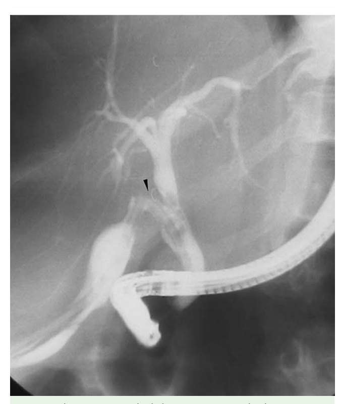
Fig.6 Endoscopic retrograde cholangiopancreatography showing contrast leakage (arrowhead) around the T-tube (minor bile duct injury).

To our knowledge, this is the first study to compare OC and LC in a subset of patients to investigate differences in the underlying injuries. It is well known that the incidence of BDI has risen with the advent of LC. Many reports quote a BDI incidence for OC in the range of 0.1% to 0.2%, whereas it has been in the range of 0.4% to 0.7% since the introduction of LC [2, 17, 18]. In this study, the nature of the BDIs differed significantly between the