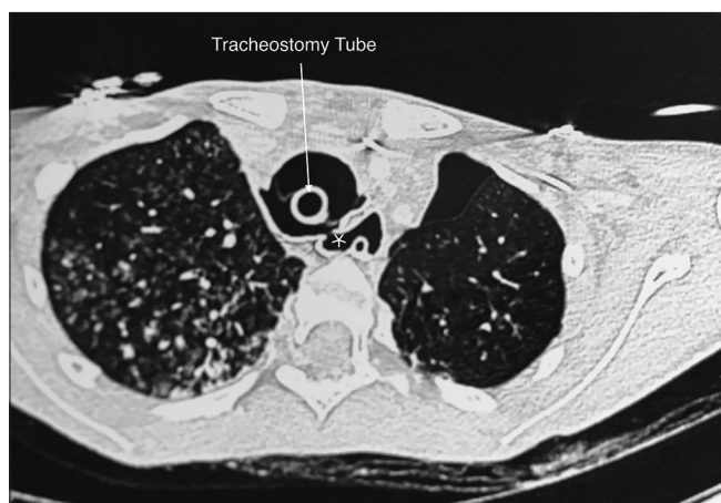
Figure 2: Axial CT image of the thorax showing the presence of a communication between trachea and esophagus (marked*)