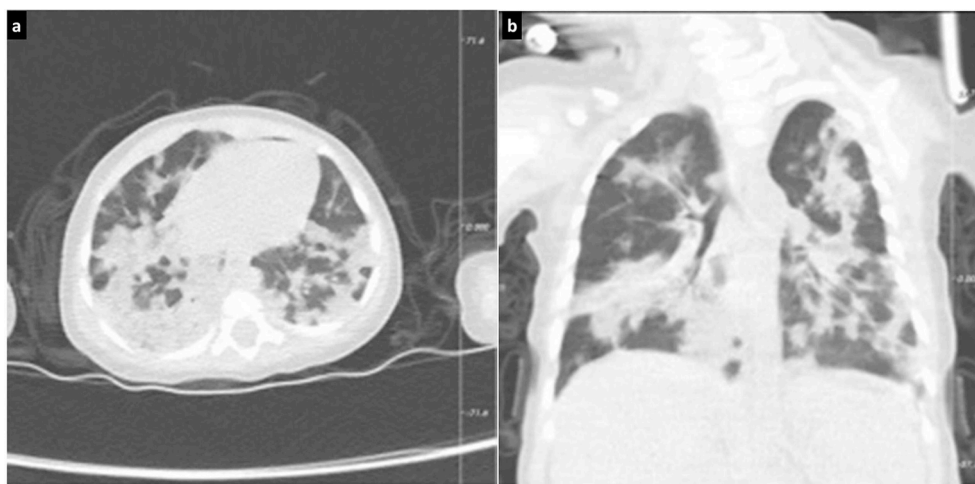
Fig. 2. Computed thorax tomography (CT) revealed irregularly limited nodular views with a size of 7–8 mm on the axial (a) and coronal (b) sections, with common patch-like consolidation areas, more prominent in the lower lobes of both lung parenchyma.

patient with hemoptysis. A case similar to our case was presented by Moissidis et al. [3] who had episodic hemoptysis and mild wheezing persisting for 5-months in a 29-month-old girl who had been followed up for recurrent pneumonia. Findings of chest radiography and CT were similar but not as diffuse as our patient. The most important difference of our patient in this case is being the first presented a case with Heiner syndrome with hematemesis clinic and acute diffuse alveolar hemorrhage. However, in the previous case of Moissidis et al. alveolar hemorrhage was diagnosed with biopsy, but no biopsy was performed in our case. In addition to the clinics and symptoms, for the diagnosis, it is also important that there are patchy and fleeting opacities or infiltrations in the chest X-ray and CT and that there are varying degrees of eosinophilia and iron deficiency anemia. CT is especially important in the diagnosis of alveolar hemorrhage and pulmonary hemosiderosis. Another important test is the demonstration of iron-laden macrophage in bronchial or gastric aspirate. Although this finding is frequent, it may not be detected in all patients. In our patient, it was thought that she might have Heiner syndrome with a history of recurrent bronchopneumonia and all the auxiliary diagnostic methods mentioned.