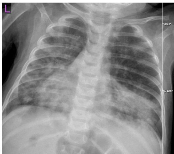
Fig. 1. PA chest radiography revealed diffuse patch-like infiltrations and nodular opacities in both lungs.

disease is usually diagnosed late. The most important thing for diagnosing is to keep the disease in mind, to know the clinic well and to exclude the diseases in the differential diagnosis. The dramatic improvement of respiratory symptoms and findings after cessation of cow's milk intake is the most important support for diagnosis. There is no specific test to diagnose the disease. In the differential diagnosis of Heiner syndrome, aspiration pneumonia, acute and chronic lower respiratory tract infections including fungal infections, immunodeficiencies, cystic fibrosis, tuberculosis, and hypersensitivity pneumonia should come to mind. The symptoms and findings associated with recurrent pulmonary infiltration are defined by Heiner et al. [4] in 7-patients; reported chronic cough, recurrent fever, tachypnea, wheezing, rales, failure to thrive, and family history of allergy. In addition, it was reported that 4 cases presented with hemoptysis and anemia clinic and the diagnosis was made by showing iron-laden macrophage in bronchial aspirate or fasting gastric fluid. In a series of 8 cases published by Moissidis et al. [3], it has been reported that patients may present with chronic rhinitis, recurrent otitis media, gastrointestinal symptoms and eosinophilia. In the same article, two out of 8-cases reported hemoptysis. Iron-laden macrophage is positive in the