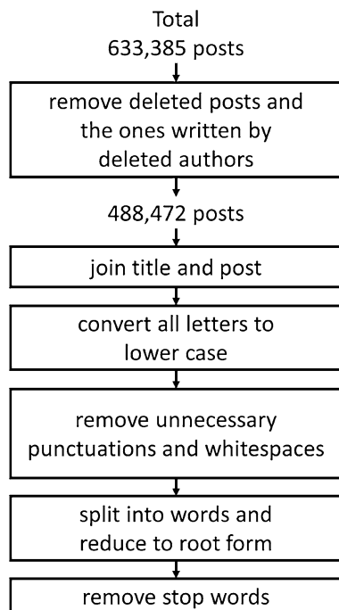
Figure 1. A data pre-processing procedure.

We divided our dataset into training (80%) and testing (20%) sets. Then, XGBoost and convolutional neural network (CNN) were employed. Moreover, we excluded the posts of users who wrote posts across multiple subreddits in learning phase.