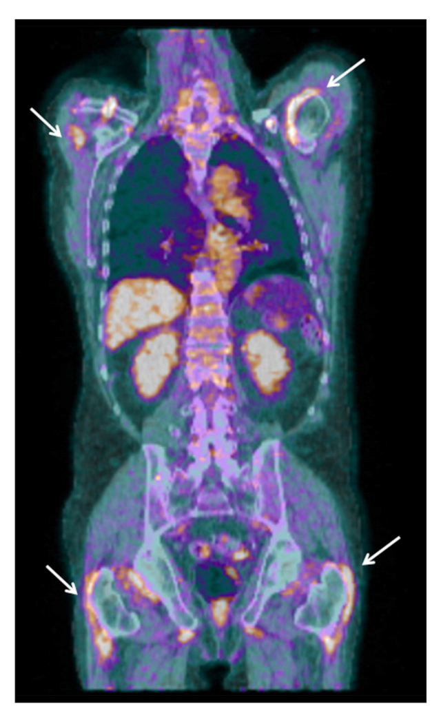
Figure 1. Fused coronal FDG-PET/CT scan of the patient suspected of having malignancy and RS3PE syndrome. Diffusely increased FDG uptake in soft tissue around the shoulder and hip girdles (white arrows) and FDG-positive axillary lymph nodes (not shown) were suggestive of polymyalgia rheumatica. Physiologic FDG uptake can be seen in the liver and the urinary tract, but there were no other pathologic findings (i.e., no evidence of bone metastases and no lesions suspicious of malignancy). The scan was performed according to the Department of Nuclear Medicine's standard procedure, which follows guidelines from the European Association of Nuclear Medicine. CT was performed as a low-dose scan without contrast enhancement.

RS3PE is a rare condition in the elderly and can appear as a first presentation of various types of rheumatic and malignant diseases. It is first described by McCarthy et al. [7] in 1985. The etiology of the RS3PE syndrome is unknown, but environmental factors and infection may affect the course of the disease. It can present alone or in association with rheumatic