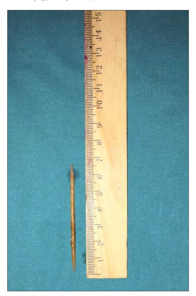
Figure 3. The wooden toothpick (6.5×0.2 cm) after endoscopic removal from the splenic flexura.