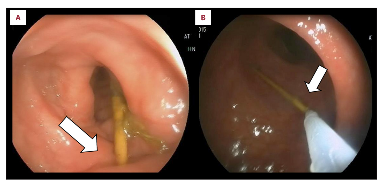
Figure 2. Endoscopic view of a toothpick impacted in the wall of the splenic flexura (white arrow) (A). Removal of toothpick with polypectomy snare (B).