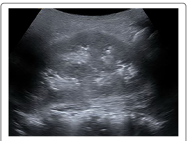
\ensuremath{\textit{Fig. 1}} Renal ultrasound demonstrated multiple calculi and nephrocalcinosis of the kidneys bilaterally

Seven weeks later, the patient began experiencing aspiration of liquids, gastroesophageal reflux, and markedly delayed gastric emptying, necessitating a laparosc opic Nissen fundoplication with gastrostomy tube and open pyloroplasty. The patient continued to suffer from nephrolithiasis, with visualization of a left renal calculus