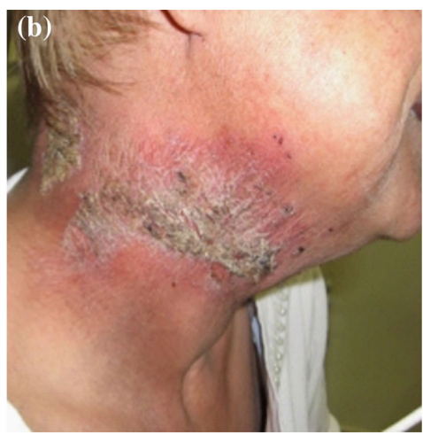
Fig. 2 Grade 2 acute radiation dermatitis. a Radiation dermatitis of the breast with moist desquamation limited to the inframammary fold. b Radiation dermatitis with moderate erythema and scaly dry desquamation. a Reprinted from Journal of the American Academy of