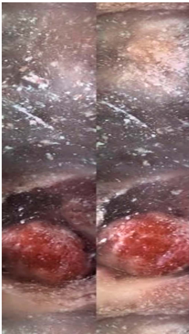
Figure 1. A benign-appearing hemorrhagic polyp noted in the gastric antrum without signs of active bleeding.

During a televisit, the patient expressed reluctance to come to the office because of her immunosuppressed status while on oral steroids. We discussed the option of TIGER VCE, and the patient agreed. The risk of capsule retention was discussed with the patient but deemed to be acceptable because of magnetic resonance enterography findings. The procedure revealed significant ulceration of the distal ileum with a Lewis Score of 215, confirming Crohn's disease. The patient was started on adalimumab (Figure 2).