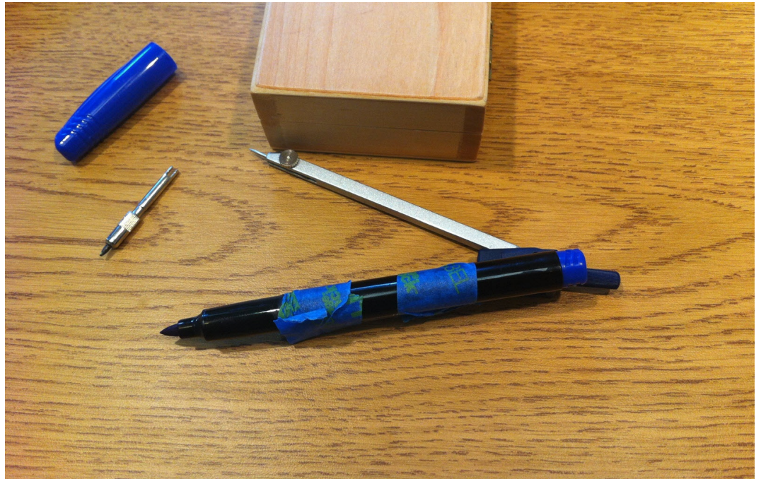
FIGURE 2: Felt-tipped pen secured to draftsman's compass

-Tape a fine-tip felt marking pen to the compass so the tip of the pen extends approximately as far as the pencil tip had extended (Figure 2).