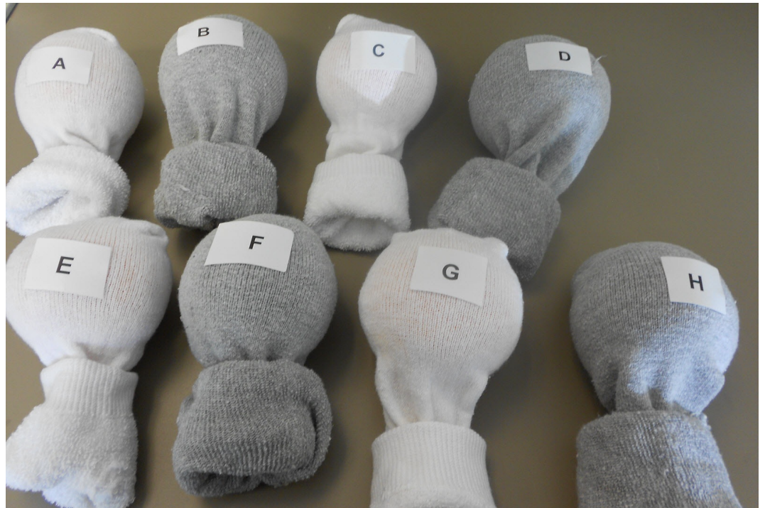
FIGURE 5: Models labeled and ready to be used

-Label each model according to the answer key (Figure 5).