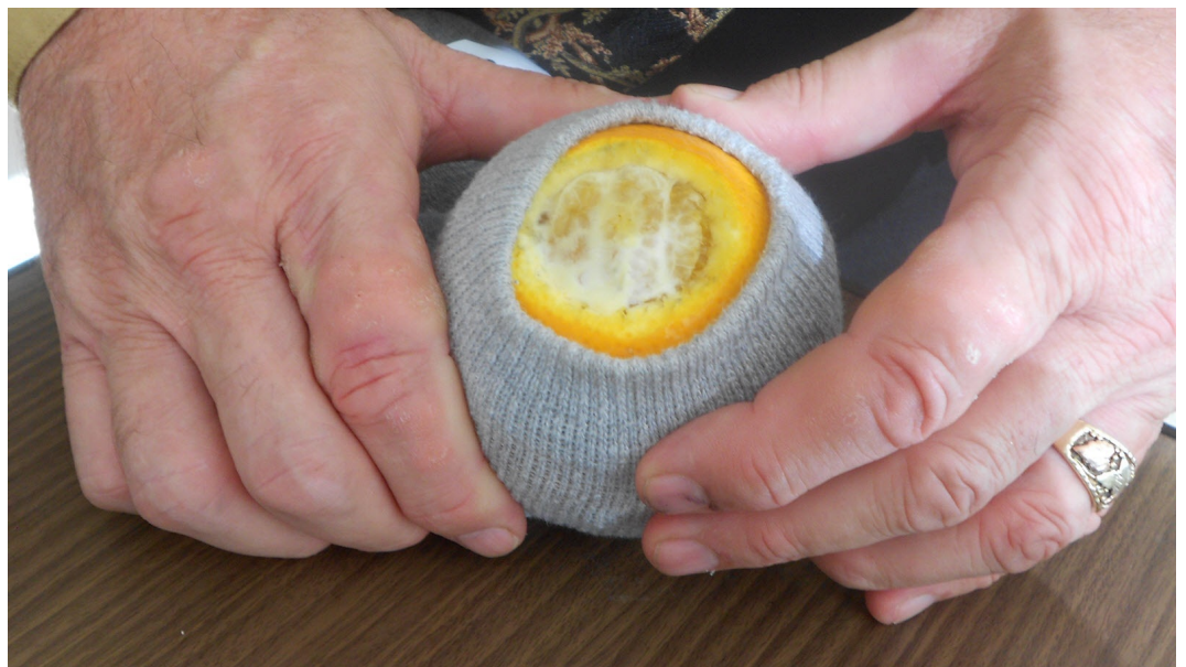
FIGURE 4: Positioning the cervical model such that it can be