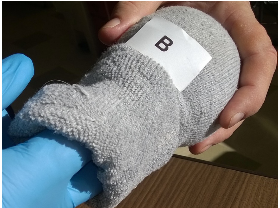
FIGURE 6: Simulated vaginal examination being performed by a student

Set out your models on a clean surface or surfaces. Supply learners with gloves and lubricant. Give each learner a recording sheet (Table 1). Every learner does a “vaginal exam” on each model and records their findings (Figure 6). When all learners have completed their score sheet, the answers are revealed. Learners with recorded findings most closely matching the correct answers “win” a prize. A discussion/debriefing completes the exercise.