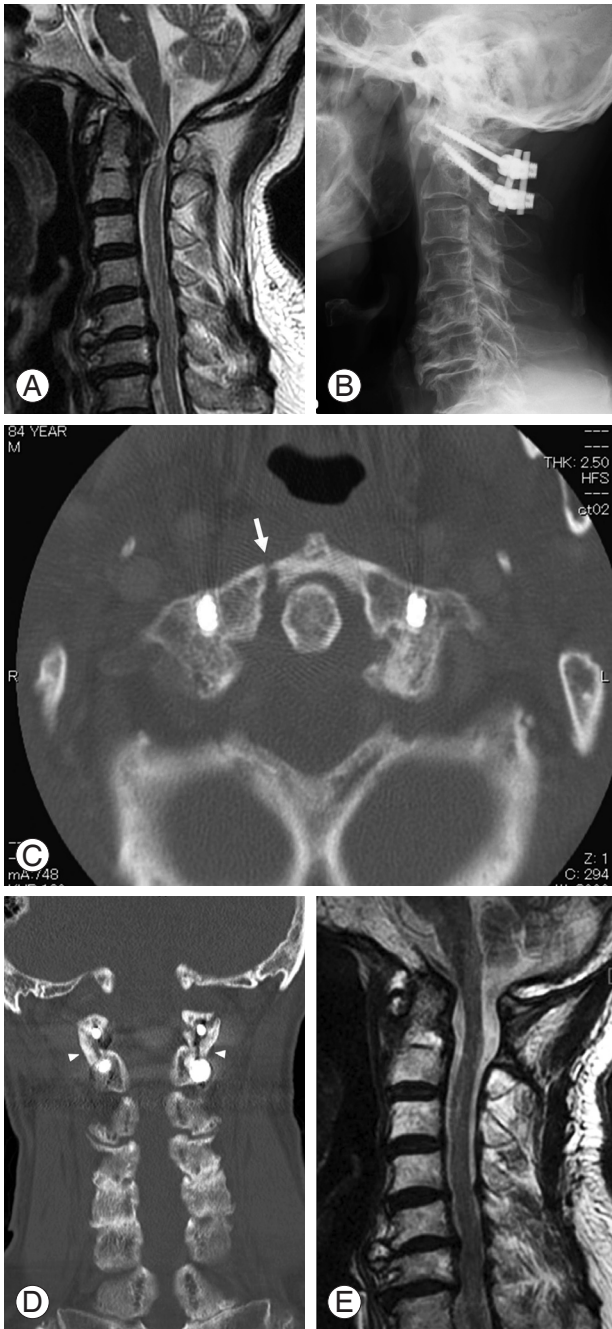
Fig. 2. An 84-year-old man with atlantoaxial instability and retro-odontoid pseudotumor underwent C1 laminectomy and posterior C1-C2 fixation with bone grafting, using bilateral C1 lateral mass screws and bilateral C2 pedicle screws. (A) Preoperative sagittal T2-weighted magnetic resonance imaging (MRI), showing severe spinal cord compression by a retro-odontoid pseudotumor. (B) Postoperative lateral X-ray taken 1 month after surgery, showing good placement of screws. (C) Computed tomography (CT) in axial orientation obtained after sustaining a fall on the floor (4 months after surgery), showing C1 anterior arch fracture (arrow). (D) CT in coronal orientation obtained 2 years after surgery, showing bone union of the C1-C2 joint (arrowheads). (E) Postoperative sagittal T2-weighted MRI obtained 2.5 years after surgery, showing disappearance of the retro-odontoid pseudotumor.

significantly increased after surgery; and they were sustained at the final follow-up (Table 3). There were no statistical differences between groups in reduction of ADI, restoration of C1-C2 angle, and the loss of correction.