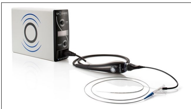
Figure 1. Peripheral intravascular lithotripsy system.

The Shockwave Peripheral IVL System is indicated for lithotripsy-enhanced, low-pressure balloon dilation of calcified, stenotic peripheral arteries in patients who are candidates for percutaneous therapy. The IVL device delivers pulsatile sonic pressure waves locally to effectively modify vascular calcium in a safe manner. The system consists of