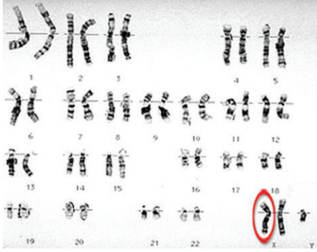
FIGURE 1: Karyogram of patient with KS suggests a 47XXY karyotype.

function tests were normal. Endocrinological examination revealed decreased levels of testosterone (6.9 pg/mL, normal range: 8.6–54 pg/mL). His radiological examination showed bilateral sacroiliitis in sacroiliac joint graphy and enthesitis in lateral heel graphy (Figure 2). Edematous signal increases were observed around bilateral sacroiliac joint in magnetic resonance imaging (Figure 2). Lung graphy and abdominal USG were normal. The patient was diagnosed with AS after clinical, radiological and laboratory tests and treatment with a nonsteroidal anti-inflammatory drug and salazopyrine 2 g/day was started. Significant regression was observed in the patient's complaints and his follow-up visits are continuing.