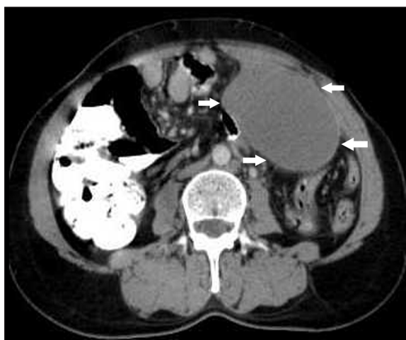
Figure 4. Axial contrast-enhanced CT image showing the lack of parenchymal enhancement in the spleen (arrows).

On post-contrast images there was a lack of parenchymal enhancement in the spleen (Figures 4, 5). On surgery, the spleen appeared congested and infarcted, and total splenectomy was performed. The post-operative recovery of the patient was uneventful and she was discharged after 2 weeks.