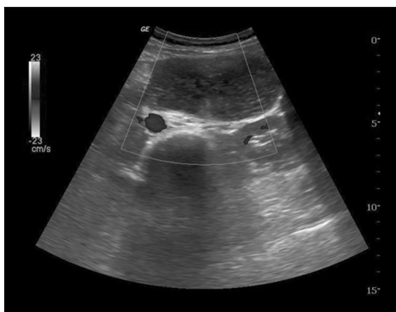
Figure 1. Transverse Doppler image showing heterogeneously hypoechoic echotexture of the spleen with no internal vascularity.