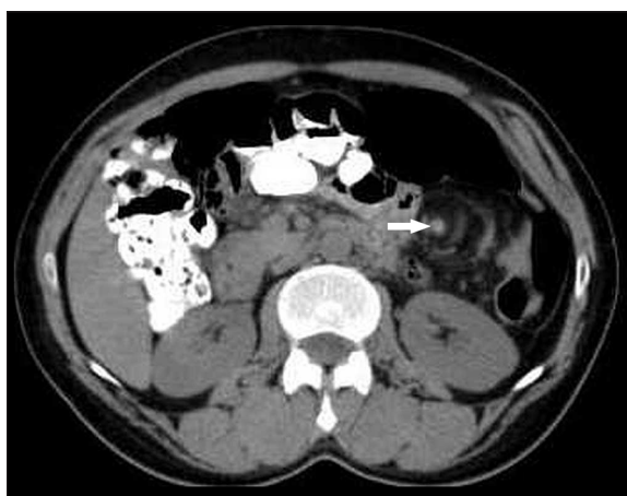
Figure 3. Axial non-contrast CT of the abdomen showing a whorled splenic pedicle with a hyperdense vessel (arrow).