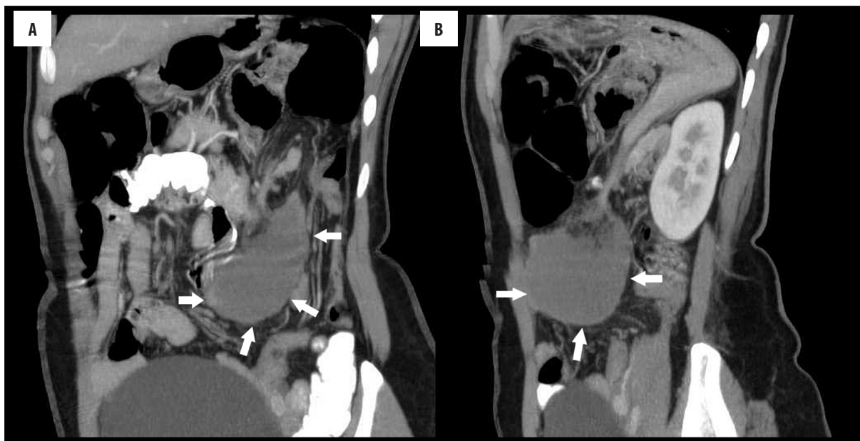
Figure 5. Oblique coronal (A) and sagittal MPR image (B) of contrast-enhanced CT showing the abnormal location of the spleen with no parenchymal enhancement (arrows).

detorsion [5]. Severe torsion results in splenic infarction and presents as acute abdomen [4,5]. In our case the patient gave a history of chronic relapsing remitting pain of the abdomen prior to the acute abdomen which, according to our speculations, was due to periods of moderate torsion and detorsion.