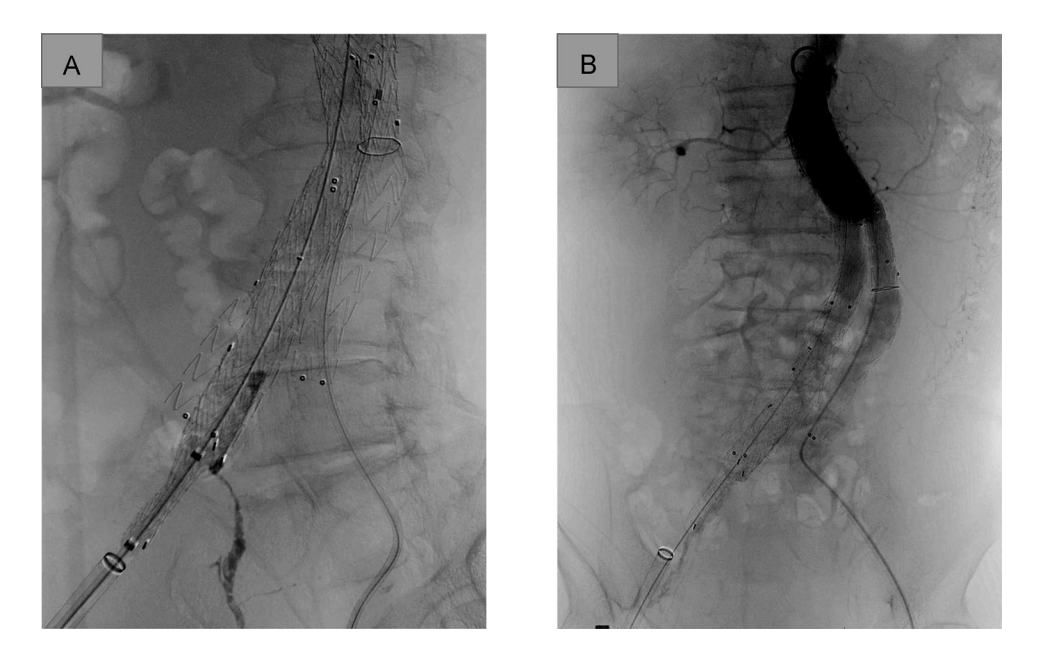
Fig. 3 – (A) An excluder extension (14.5 mm x 14 cm) was deployed into the right leg of the main body. An excluder extension (10 mm x 7 cm) was then deployed into the right external iliac artery with glue embolization of the right internal iliac artery. (B) Completion angiography shows a successful AAA exclusion without endoleaks.

reaching the AAA diameter immediately after the EVAR. The lack of data regarding the timing of rapid expansion or rupture means that close follow-up is mandatory, and early reintervention may solve this issue. Although EVAR is the standard procedure for treating anatomically suitable infrarenal AAA, physicians should be aware of this potentially lethal clinical scenario.