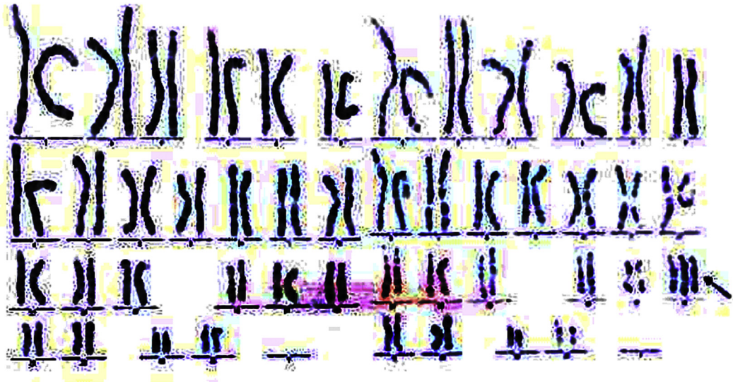
Fig. 1. Chromosomal analysis of the patient showed 47 chromosomes with an extra chromosome 18 (arrow).