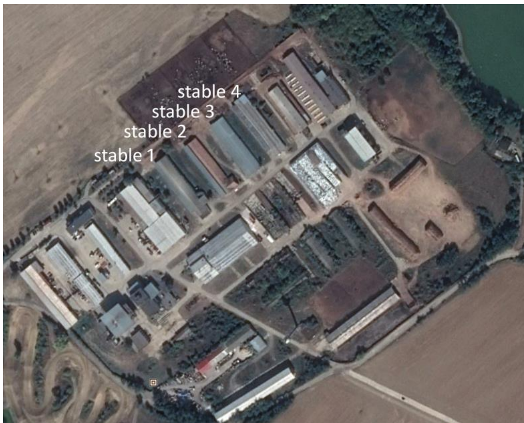
Figure 1. Area of the farm with four study stables. Several more stables are present, but were not included in the study. North of the stables, a fenced area is visible, where the animals stay while the stables are cleaned.