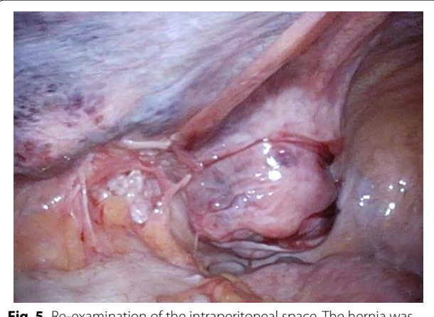
Fig. 5 Re-examination of the intraperitoneal space. The hernia was repaired and no findings suggested strangulation in the bowel