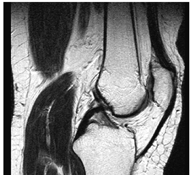
Fig. (1B). In magnetic resonance image, patellar surface lesion is interpreted to be grade II