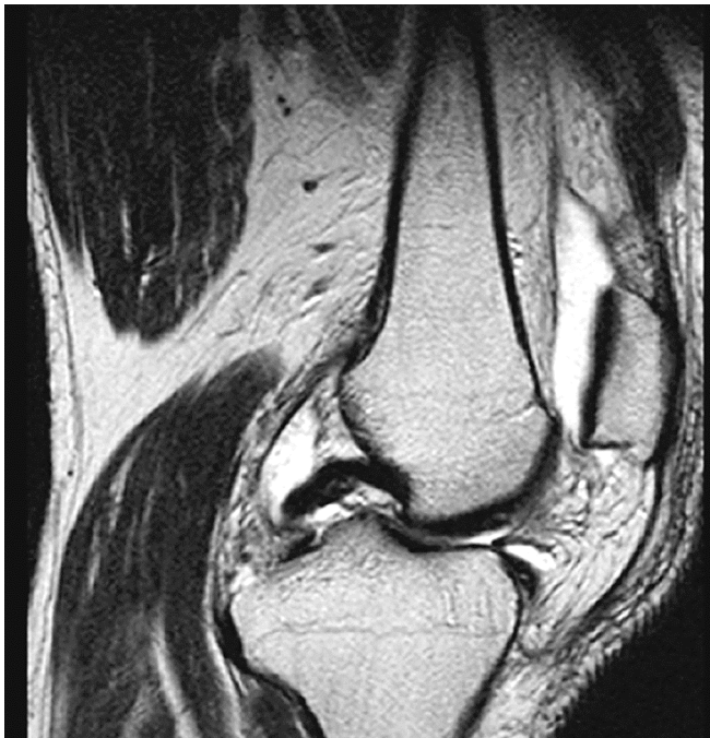
Fig. (2B). The grade III lesion of the medial tibial plateau in Fig. (2A) was interpreted to be grade II in magnetic resonance image. Grade I irregularity of the medial femoral condyle was not detected in MRI.

At best, sequences in common clinical use today are very reliable. Examining 130 patients, Bredella et al. [8] used 1.5 Tesla magnet with a combination of all three planes, sagittal, coronal, and axial. They were able to discover cartilage abnormalities with a sensitivity of 93%, specificity of 99%, and accuracy of 98%. In their research, arthroscopy was likewise considered the gold standard. Systematic review by MacKenzie et al. [15] included 7 studies that reported overall sensitivity of 89%, specificity of 92% and accuracy of