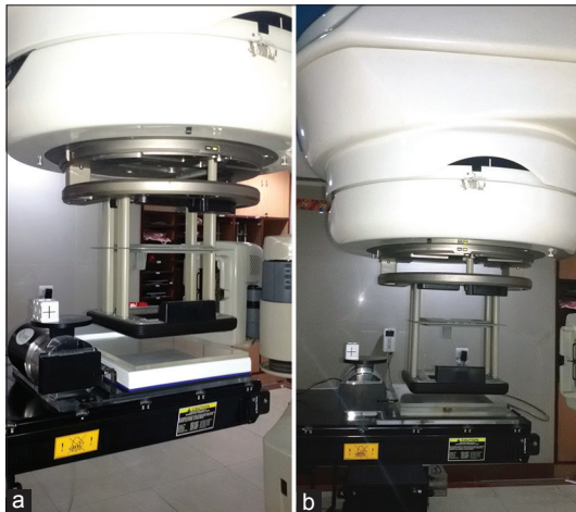
Figure 1: Experimental setup: (a) Dose profile measurement using Imatrix 2D array placed over QUASAR motion platform, (b) Beam output measurement using Markus plane parallel ionchamber placed over motion platform

It was observed that the dose profiles of gated delivery are in good agreement ( <0.7\% ) with the corresponding non-gated delivery [refer Tables 1 and 2]. The maximum deviation of 0.7% was observed in flatness for the electron energy 6 MeV at a dose rate of 100 MU/min and breathing period of 4 s. Similarly the maximum symmetry deviation was 0.7%