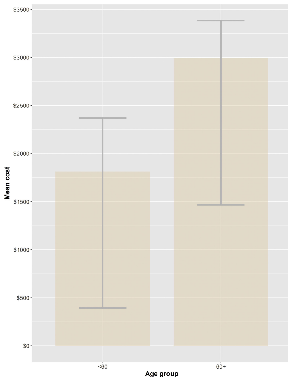
Figure 2. Direct medical costs due to COVID-19 by age groups.

total of 24 people were hospitalized for 1 day, with an average cost of $468; 12 people were hospitalized for 9 days, with an average cost of $2456; and 12 people had a hospital LOS of 16+, with an average direct medical cost of $4856. The red line in Appendix Figure 2 in Supplemental Materials found at https://dx.doi.org/10.1016/j.vhri.2022.04.00 displays the exponential trend in average COVID-19 costs of care as the number of hospital days increases.