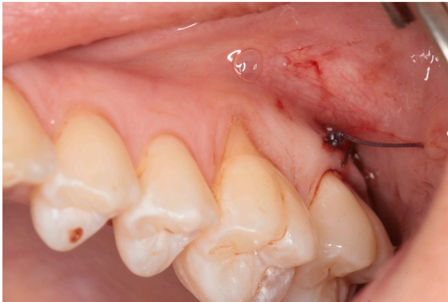
Fig. 2. Initial vestibular lesion observed in the tooth 26 before muco-gingival management.