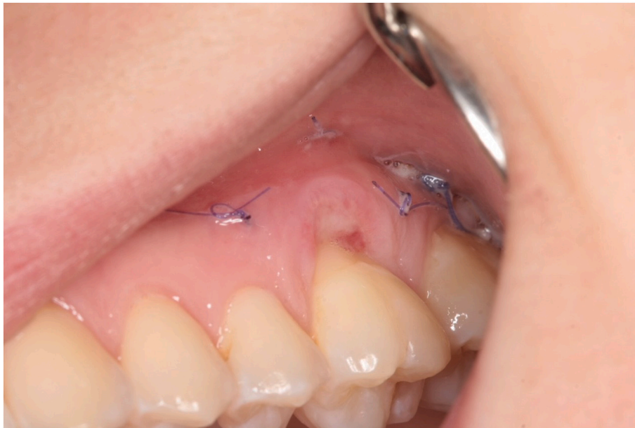
Fig. 4. Situation 8 days after root-covering surgery on tooth 26.