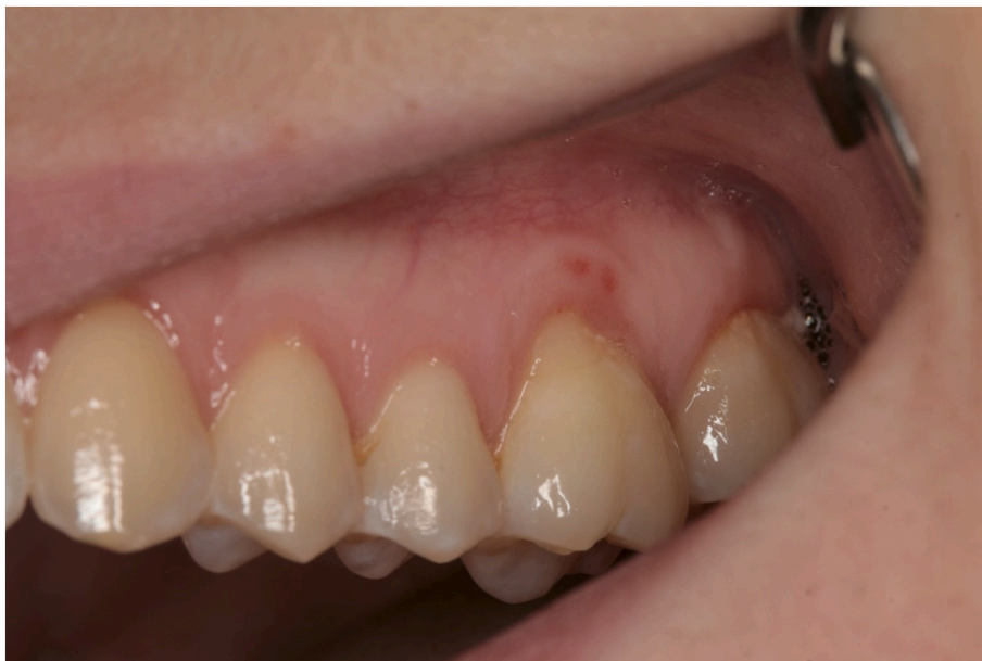
Fig. 5. Situation 45 days after root-covering surgery on tooth 26.