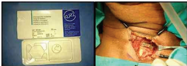
Figure 2 A, Titanium vocal fold medializing implant (TVFMI®). B, TVFMI® placed in the cartilage window.

post-operative values of GRBAS were compared separately using paired Student's t-test. Individual parameters of acoustic analysis and EGG were also compared pre- and post-operatively, and the p-values were calculated. Student's t-test for independent variables was used to compare the improvement in parameters (VHI, GRBAS, acoustic analysis, EGG) following the type I thyroplasty with silastic implant or TVFMI®. p-values less than 0.05 were considered to be significant (95% confidence interval).